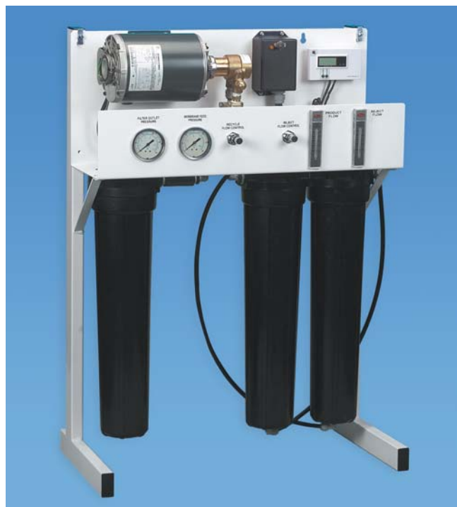
R-13 with optional stand