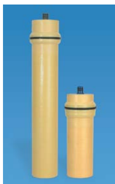
Proprietary Membranes (for R-13 systems)