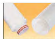
222 or 226 / Flat