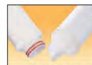
222 or 226 / Fin